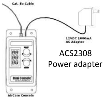
ACS2308 Power adapter